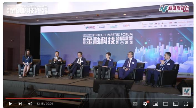
【香港金融科技發展大獎2023】論壇主題：Web 3.0 時代下的金融